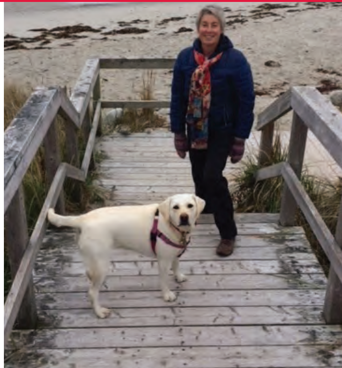
Sandy is back to enjoying a full and active life, thanks to your generosity. Your support of clinical trials gives the precious gift of time. Thank you!

Not only has the clinical trial given Sandy the precious gift of time, but she also finds the dosage easy to tolerate.